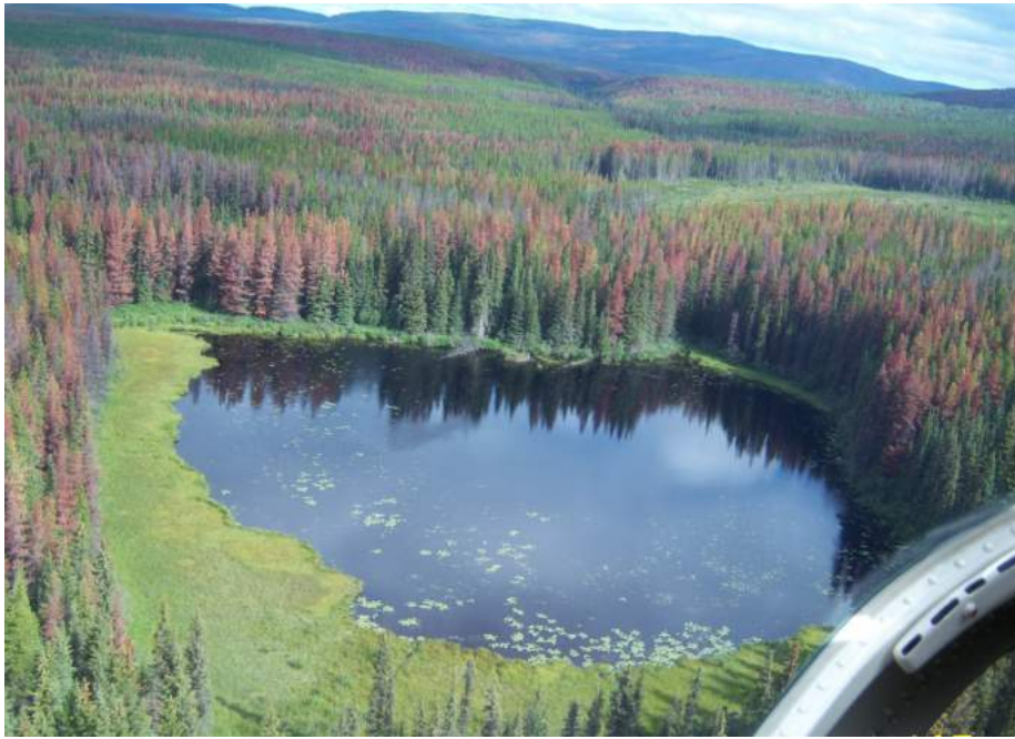
Figure 2. Typical lake sample site, located north of Mount Milligan, British Columbia.