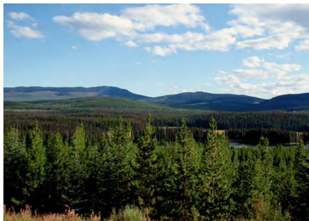
Figure 3. Subdued topography of the southwest corner of the study area, British Columbia. View is towards the east with Mosquito Hills in the background.

The Tahtsa Lake district lies within the Stikine Terrane, just east of the Coast Crystalline Belt (Monger et al., 1991). The west half of the study area is underlain mainly by Early to Middle Jurassic Hazelton Group volcanic and sedimentary rocks (MacIntyre, 1985). In places, these rocks are unconformably overlain by Middle to Late Jurassic Bowser Lake Group marine sedimentary rocks and Early Cretaceous Skeena Group turbidites and local basalt flows. These rocks are in turn unconformably overlain by felsic pyroclastic rocks, felsic flows and younger basaltic flows of the Early to Late Cretaceous Kasalka Group volcanic rocks. Many small- to medium-sized, Late Cretaceous to Early Tertiary stocks have intruded these volcanic piles and sedimentary packages (MacIntyre, 1985). The east half of the study area is dominantly underlain by Late Cretaceous to Tertiary Ootsa Lake Group and Eocene Endako Group volcanic rocks. There is a strong correlation between the location of intrusive rock types (in particular, porphyritic intrusions like those of the Late Cretaceous Bulkley suite) and the locations of Cu, Mo, Au, Pb, Zn and Ag mineralization (Carter, 1981; MacIntyre, 1985).