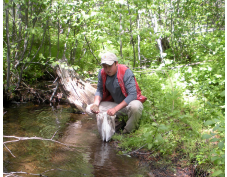
PHOTO 1. Collecting stream sediment samples for geochemical analysis.

Finally, Geoscience BC is also supporting a partnership regional bedrock mapping program in the Dease Lake area, which will be led by the BC Geological Survey (BC Ministry of Energy and Mines). This work will be based out of Dease Lake and conducted by a small team of geologists accessing the area by truck and helicopter.