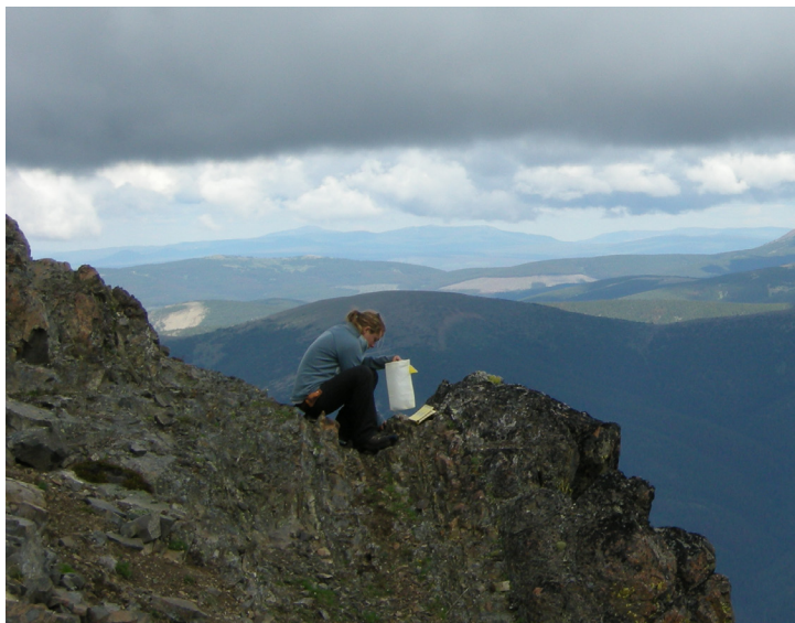
PHOTO 2. Regional mapping in British Columbia.

The QUEST-Northwest program will produce new digital geoscience products and a series of maps combining the results of the above surveys with existing publically available geoscience information. All results are expected to be available in early 2012.