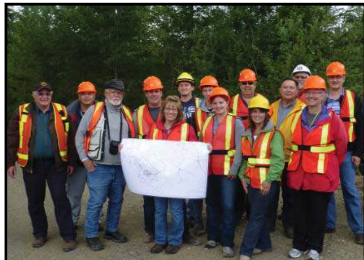
"Mining - What's It All About?" Short Course, Campbell River, BC.

The results of both the geophysical and the geochemical surveys will contribute to a better understanding of the North Vancouver Island's mineral potential and should attract the exploration industry's attention to the area and help target areas of higher mineral potential.